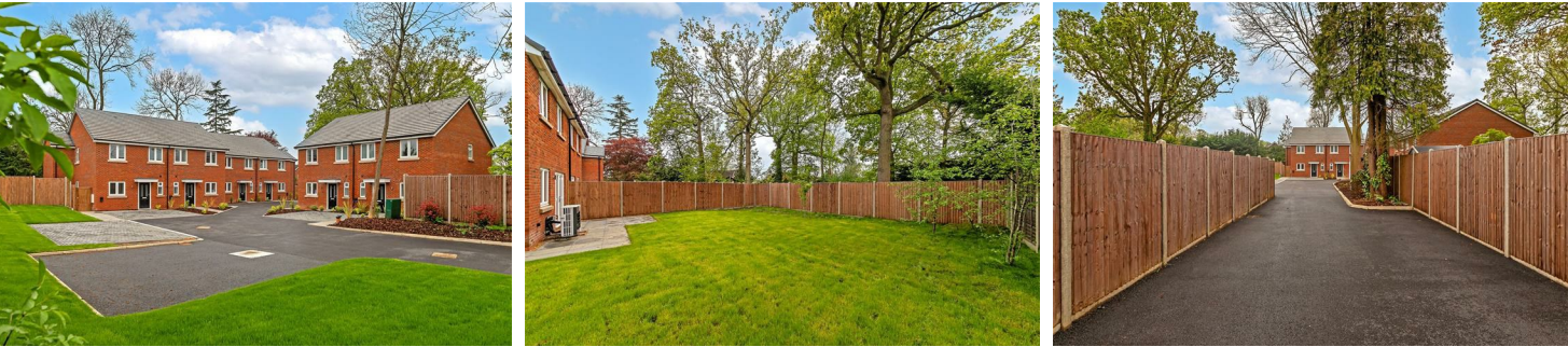
Ground Floor Approx. 518.3 sq. feet

Oakview Gardens is a select luxury development of just six stunning homes situated in a quiet secluded location providing a tranquil escape from the bustling world and offering the perfect space for families looking for extra room to grow. Step into the stunning interior designed homes and enjoy the different styles and layouts of the three and four bedrooms homes. Embrace the beauty of the outdoors with French doors leading to the expansive rear gardens surrounded by mature oak trees. Furthermore, Oakview Gardens homes boast a high B EPC rating, indicating their energy efficiency and environmental friendliness. Designed to the most modern building regulations, these homes are exceptionally well-insulated, ensuring optimal comfort year-round while reducing energy consumption. The show house is furnished to give prospective purchasers ideas as to how a property can be adorned with their own goods and chattels and items therein are not included as part of any individual property sale unless otherwise stated. All images, photographs and dimensions are not intended to be relied upon for, nor to form part of, any contract unless specifically incorporated in writing into the contract and some finishes and garden presentations have been digitally created and enhanced for marketing purposes.